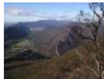
Clockwise from top right Map of Victoria, Grampians, Bells Beach, Great Ocean Road, Docklands at night and the city of Melbourne